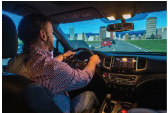
INSIDE RDS-2000 FULL CAB SIMULATOR USING SIMVEHICLE

But vehicle dynamics research calls for more than just accurate and precise real-time multi-body dynamics modeling. In order to do meaningful work, vehicle simulation solutions need to translate those numbers into an authentic, coordinated, multi-sensory driving experience for test drivers. That platform also needs to make it easy to track what that experience means to those drivers. With these tools, you can greatly expand the role vehicle dynamics simulation plays in your design and development process.