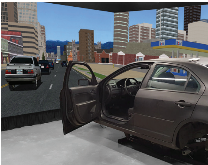
RDS-2000 FULL CAB SIMULATOR

This is all handled through user-selectable/configurable/customizable input data files. You can directly access and modify these via the included graphical Vehicle Dynamics Editor . Modify any vehicle with your engine map, breaking profile, gear ratios, or other dynamics. The SimVehicle system models all four corners